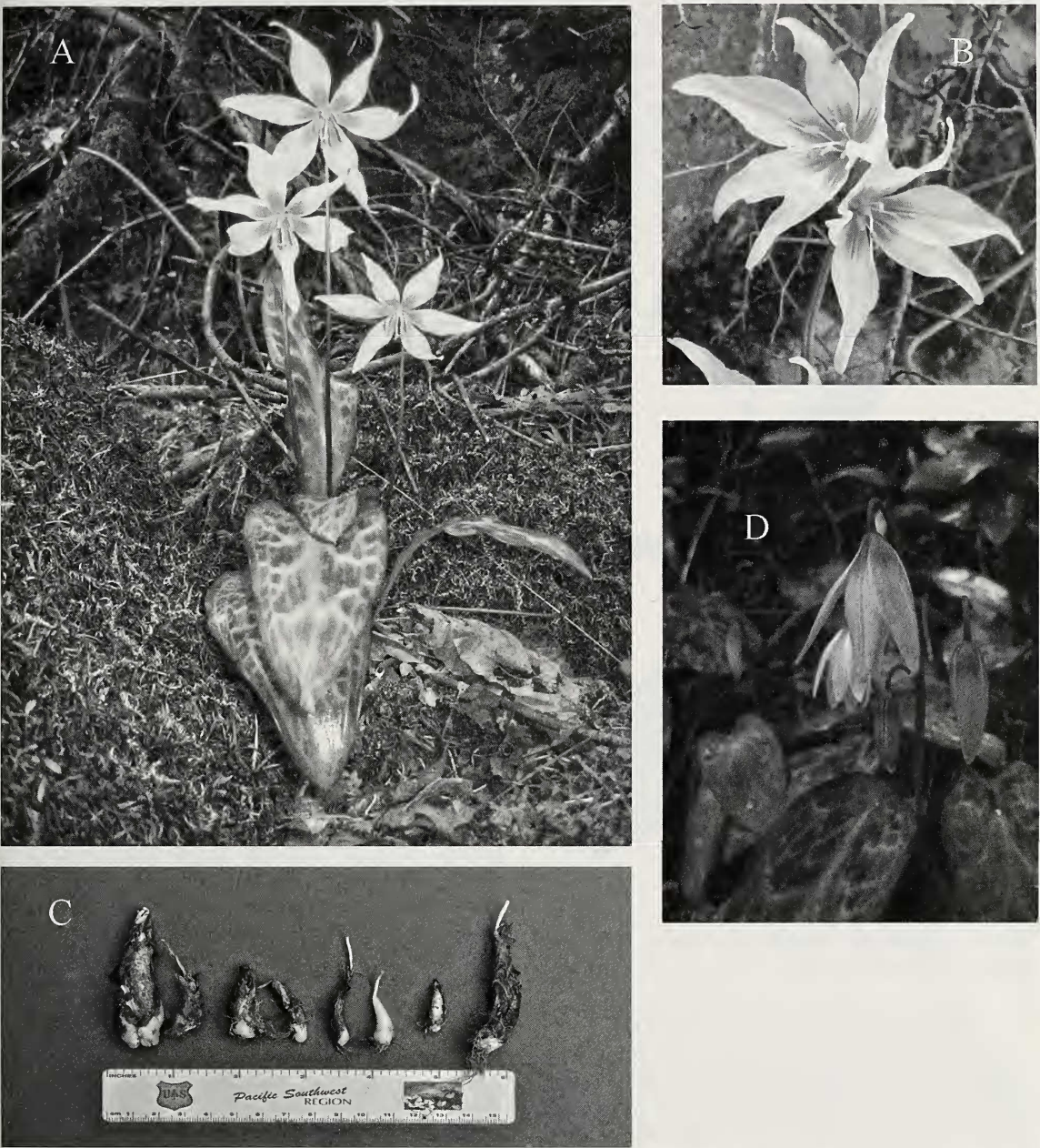
FIG. 3. Erythronium shastense . A. Two adjacent plants in limestone habitat. B. Flowers showing declined styles. C. Bulbs from several plants. D. Pendent buds.

McCloud River Arm of Shasta Lake, shaded limestone rock shelves and crevices, 40.80422°, -122.27111°, 900 m (2960 ft), 19 May 2012, York 3112 (HSC); 1 mile south of McCloud River bridge along road between Ellery Creek and Pine Point Campground, 350 m, 5 March 2003, Taylor & Reyes 18467 (JEPS100448, UC1755122); McCloud Arm Lake Shasta, along road between Ellery Creek and Pine Point Campground (ca. 1 mile south of McCloud River bridge), 350 m,